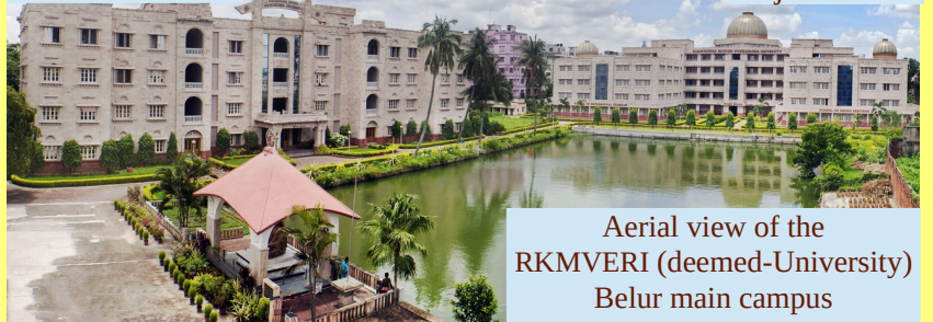
Aerial view of the RKMVERI (deemed-University) Belur main campus